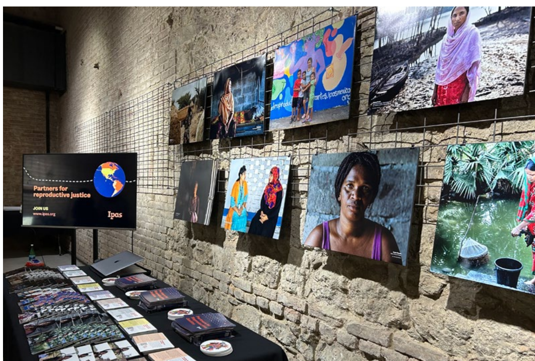
Ipas photo exhibit at the HRFN Festival in Tbilisi, Georgia

This fiscal year we focused on engaging with foundations and philanthropies, and we joined the Ariadne Reconnect , Global Philanthropy Project donor meeting and Human Rights Funders Network Festival in Tbilisi, Georgia. It brought together 300 human rights activists and funders, and we made many new connections and learned about new and old foundations and funders. New connections were also made with foundations of larger corporations and initial conversations for collaboration with the Ipas Impact Network commenced. We organised a photo exhibit at the HRFN Festival called “Locally led, globally connected: Partners for reproductive Justice” in which we highlighted our work around gender equity, climate justice and reproductive freedom, primarily with grantees of the Ipas Collaborative Fund.