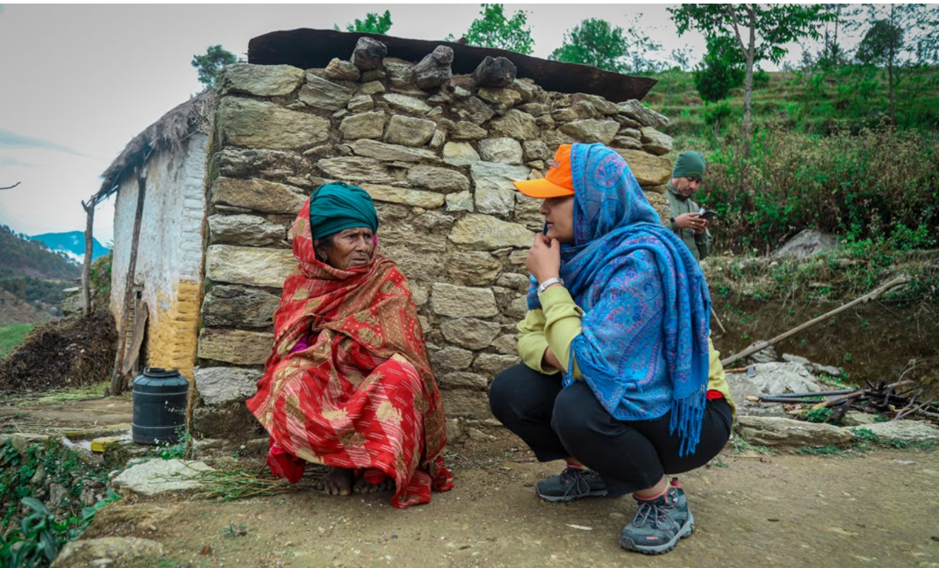
Ipas Nepal staff discuss the impact of climate change with an older woman in Achham District, Nepal.

— Participant of the 21 st International Dialogue on Population and Sustainable Development