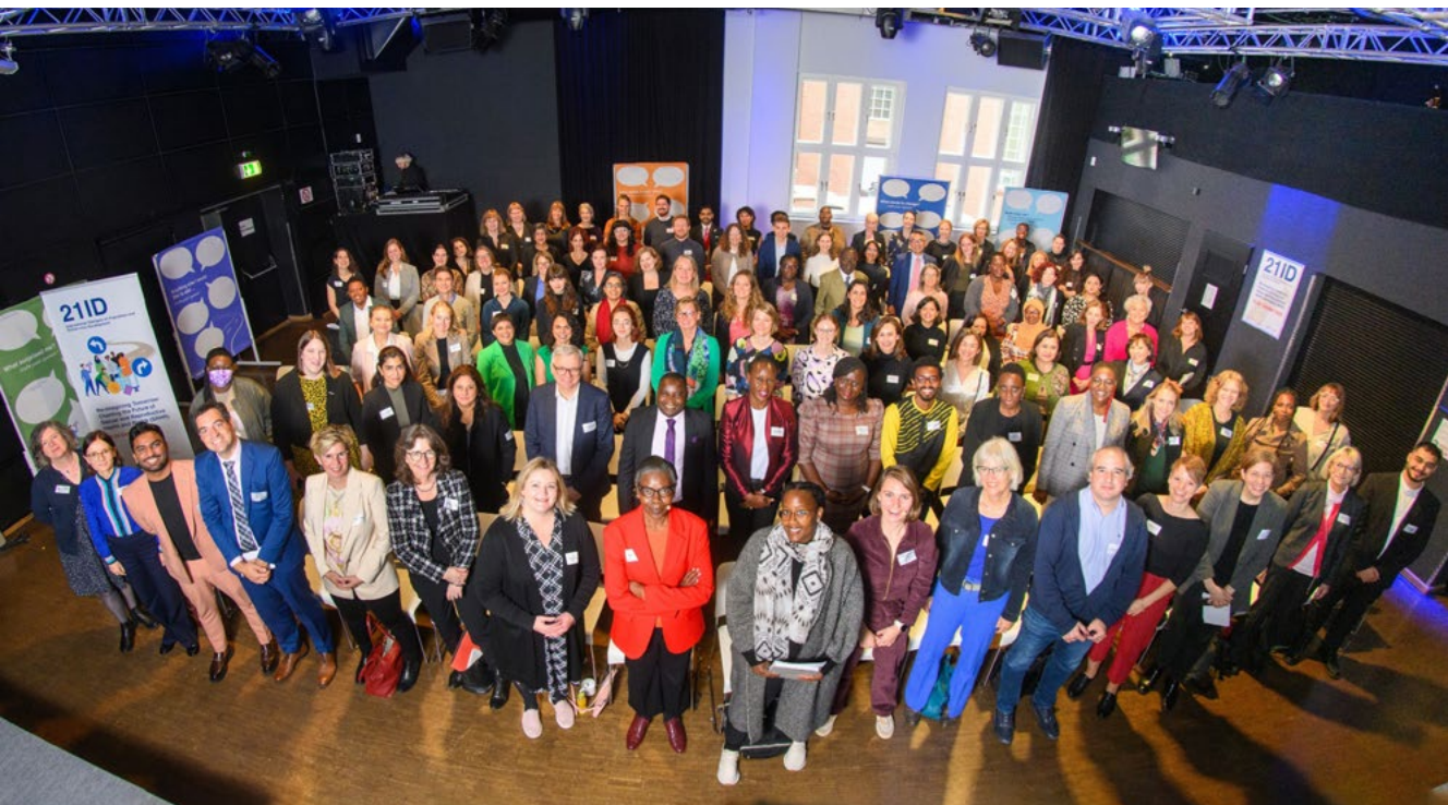
Stichting Ipas Europe supported the 21st International Dialogue on Population and Sustainable Development in Berlin.

Over the last few years, Ipas Europe has expanded the Ipas footprint and advanced the mission of Ipas across Europe by building partnerships with new donor governments, foundations and partners and have strengthening existing donor relations and partnerships in the region. As a result, the Ipas network significantly expanded, further positioning Ipas as a global leader in reproductive justice and as a rights-based thought leader across Europe. This physical presence in Europe has established Ipas as a strong European partner, now regularly advising and influencing government, philanthropic and other institutional donors, participating in technical fora that advance Ipas’s mission and building network connections to consortia, partnerships and development opportunities globally.